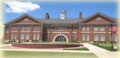
University of Georgia — Griffin Campus, Griffin, GA